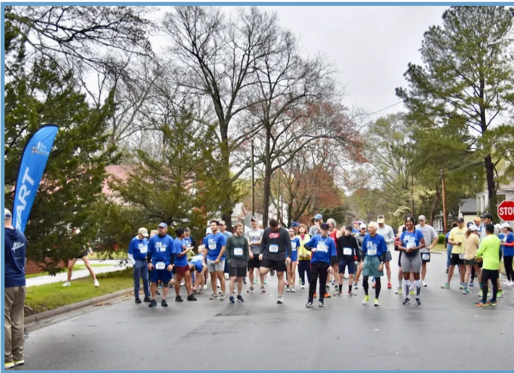
The Annual 5K for TCO, held on March 23, supporting Tarboro Community Outreach.