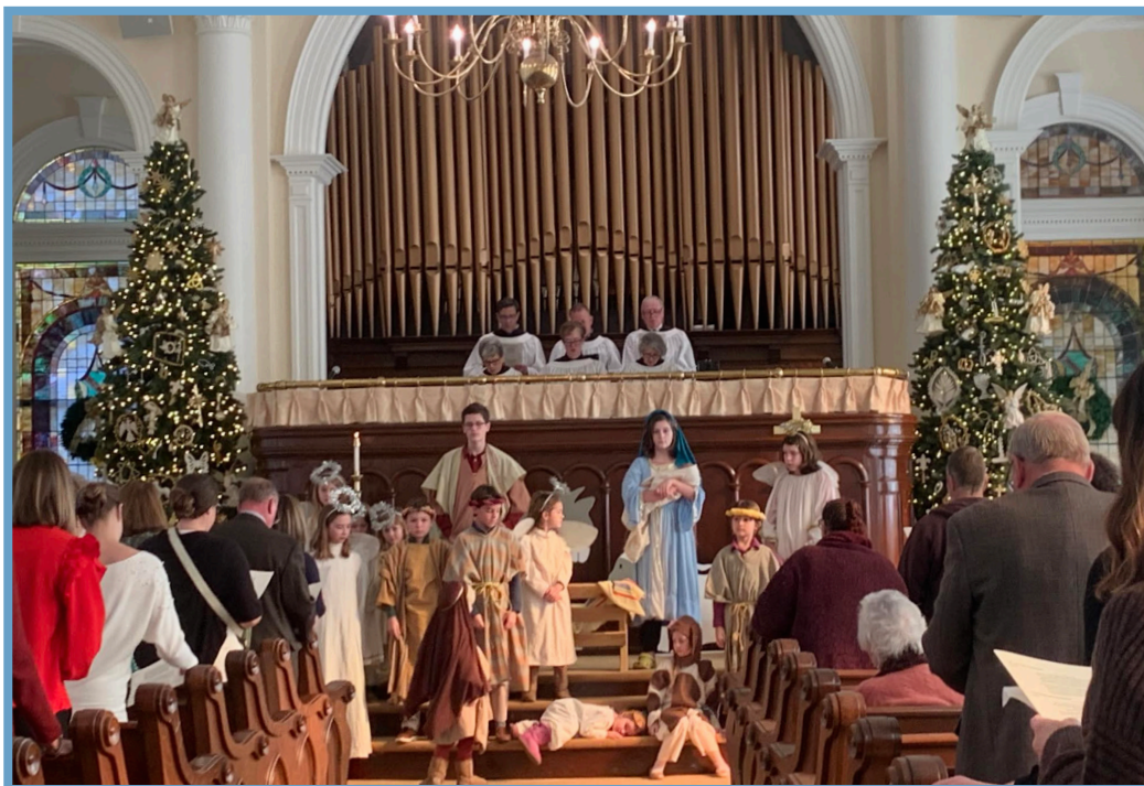
Christmas Eve Nativity Service.