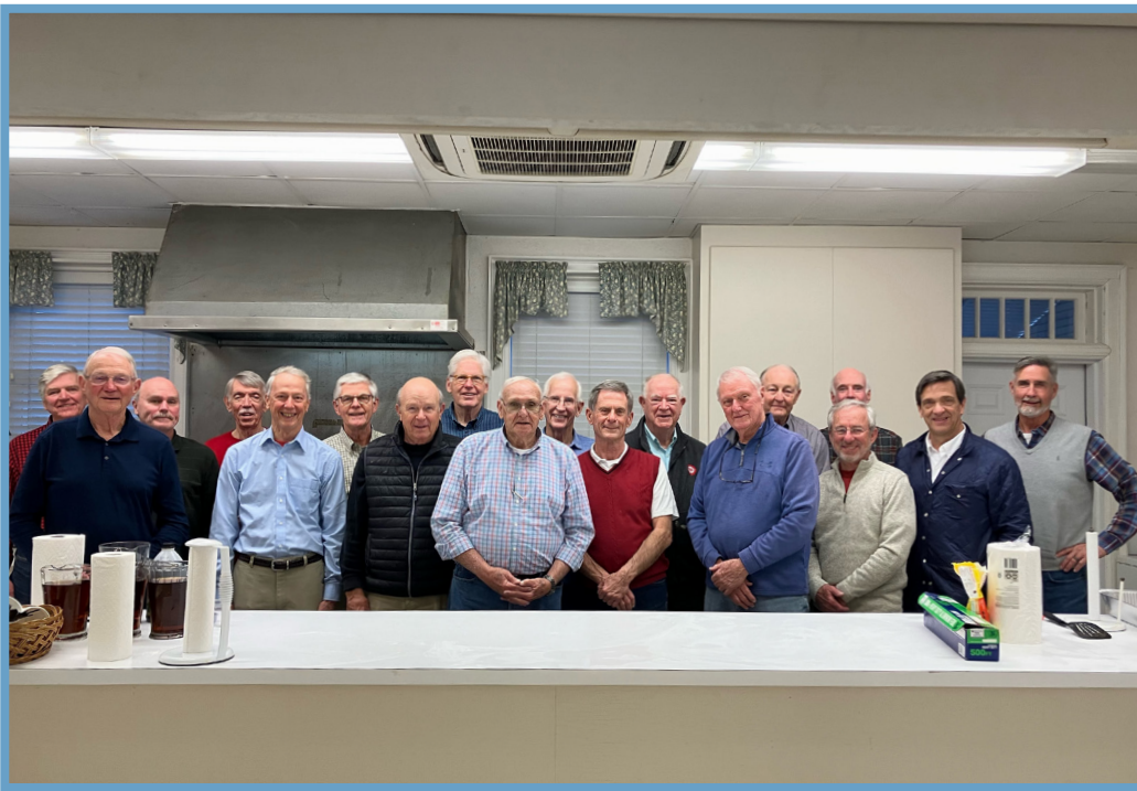
Men of the Church provided the Ash Wednesday Pancake Dinner.